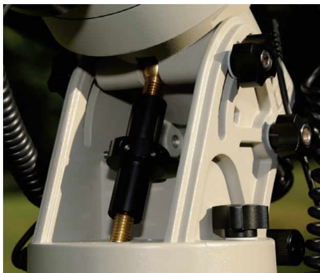
A robust screw ( left ) provides precise adjustment of the polar-axis altitude. The hand controller's 8-line display ( right ) also shows the location of Polaris on the polar-alignment reticle when the mount is properly aligned ( below ).

Overall, I'm impressed with the iEQ30. From experience, I can confidently say that a solid, portable, mid-weight German equatorial mount is a blessing for amateurs like me who do observing and astrophotography with a variety of telescopes at different locations. My Vixen has served me well, but as much as I like it, I'd trade it in a heartbeat for the iEQ30!